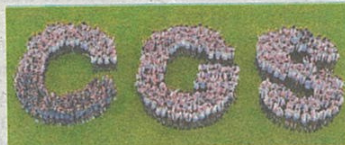
Court Grammar School students.

In my opinion, children are kind and care about the environment, animals and family. Some parents are so busy worrying about work that they forget to play, to see the nature around them. If you let us vote, we will help remind adults about what is important. It is our future . . . it should be our say!